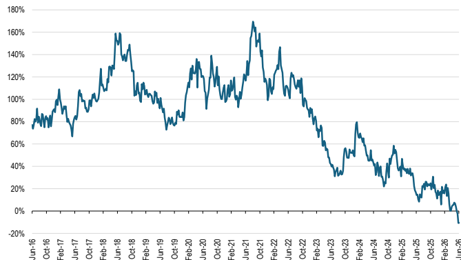
Figure 2: ASML valuation premium/discount to US peers