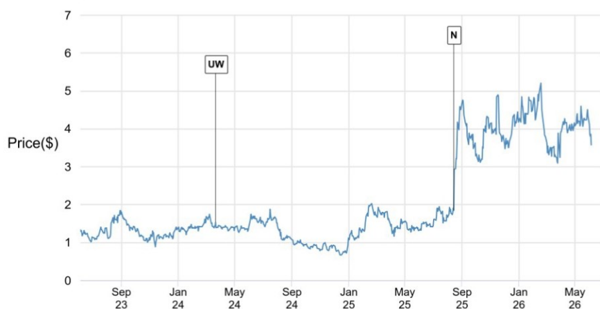
Precigen (PGEN, PGEN US) Price Chart

Company-Specific Disclosures: J.P. Morgan does and seeks to do business with companies covered in its research reports. As a result, investors should be aware that the firm may have a conflict of interest that could affect the objectivity of this report. Investors should consider this report as only a single factor in making their investment decision. Important disclosures, including price charts and credit opinion history tables (if applicable), are available for compendium reports and all J.P. Morgan–covered companies, and certain non-covered companies, by visiting https://www.jpmm.com/research/disclosures , calling 1-800-477-0406, or e-mailing research.disclosure.inquiries@jpmorgan.com with your request.