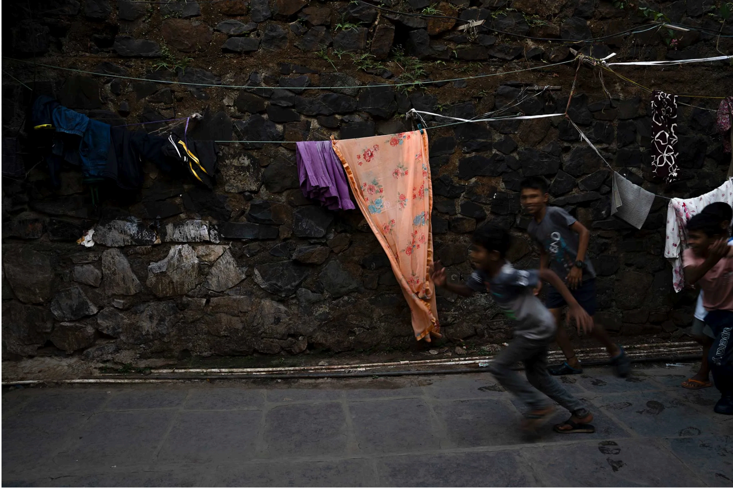
Lanes of an informal settlement in Worli.