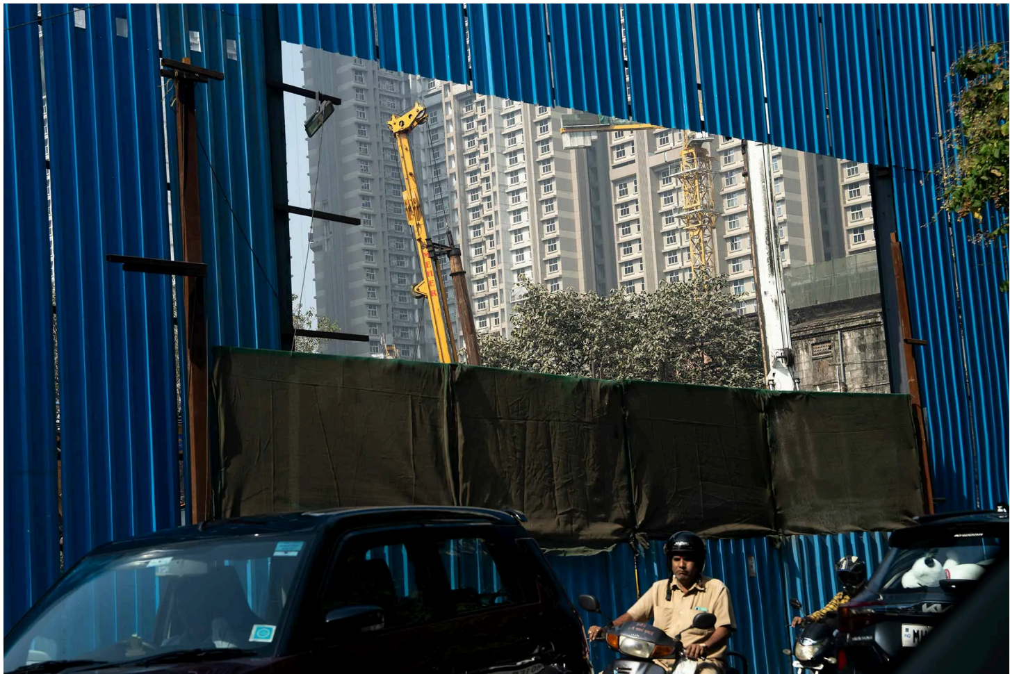
Construction in Worli.

按当前价格计算，沃利一套同等面积的公寓价值可达 4000 万至 5000 万卢比。即便只是其中一小部分，也足以让维尔马勒一家立刻跻身梦寐以求的“千万富翁”行列——即净资产达到 1000 万卢比或以上。（在印度数字体系中，1 千万等于 1000 万。）维尔马勒并不拥有土地所有权，该地块归孟买市政公司所有。但由于他多年来一直支付土地租赁费用，因此享有公寓居住权。而那些向他人租用棚屋的租户，则需无条件搬离且无法获得补偿。