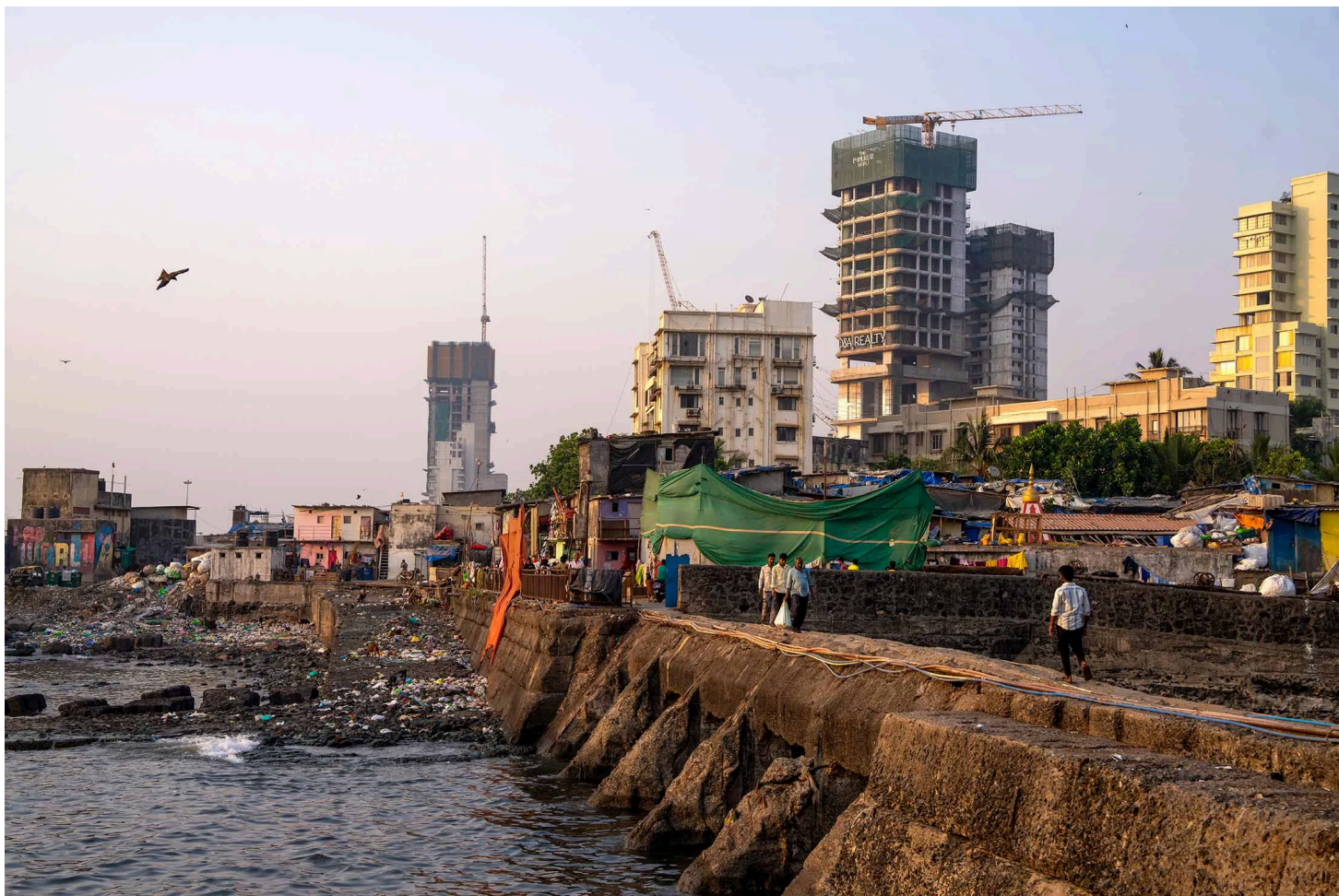
A sunset in Worli.

但即使在 BKC 闪亮的塔楼周围，孟买的复杂性也显而易见。多年来，金融区较老的住宅区和一些贫民窟一直被忽视。孟买有关于改造贫民窟的法律，旨在确保开发商不能简单地占用土地。